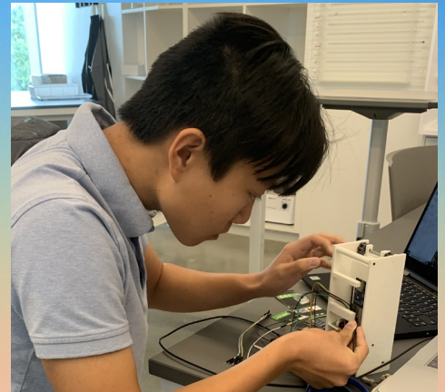
RANSOM EVERGLADES SCHOOL, MIAMI, FL DNA MUTATIONS IN THE STRATOSPHERE