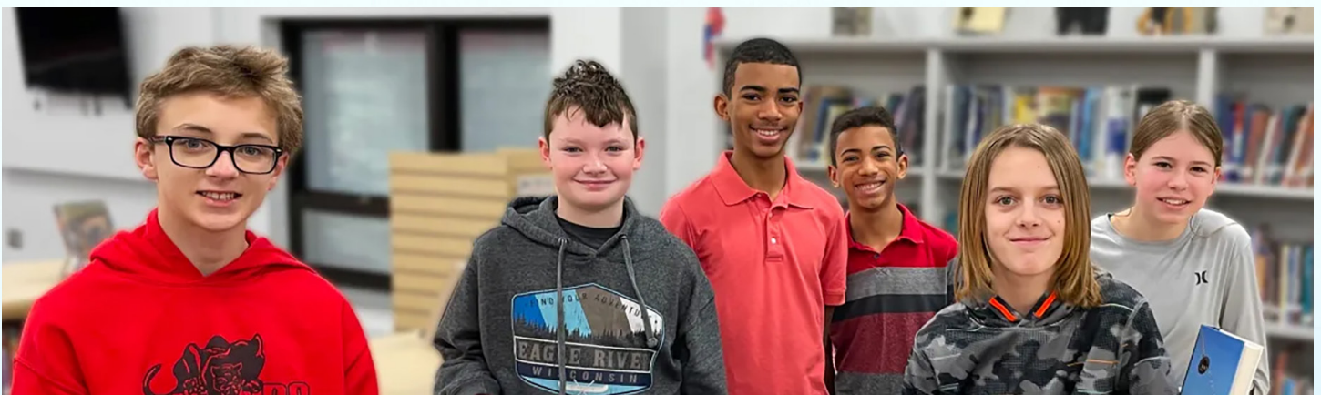
PILGRIM PARK MIDDLE SCHOOL, ELM GROVE, WI LOW-PRESSURE PROPELLER SYSTEM