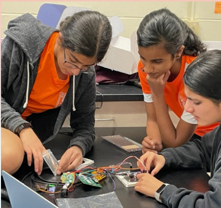
HOPKINTON MIDDLE SCHOOL, HOPKINTON, MA CORROSION OF METAL IN OUTER SPACE