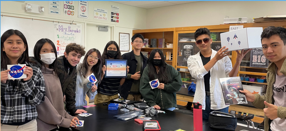
WALTON INTERMEDIATE, GARDEN GROVE, CA MINERAL DUST INVESTIGATION